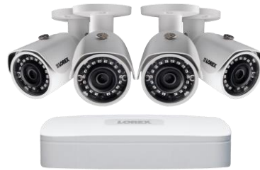
IP security cameras