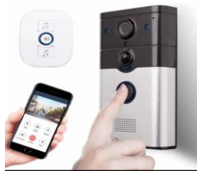
Smart door bells