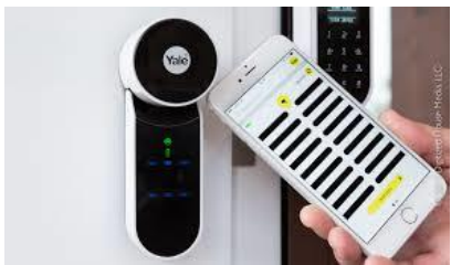
Smart door locks